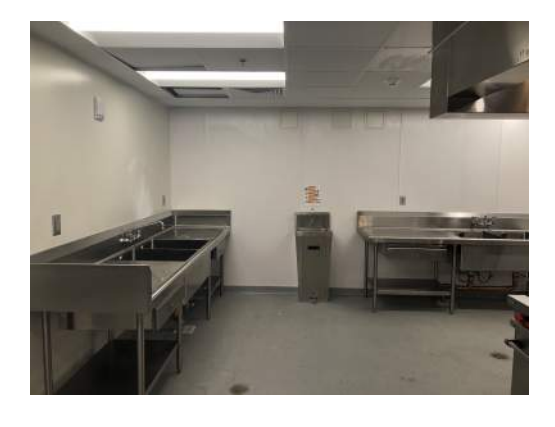
Installation of Sinks and FRP Panels in the Culinary Arts Lab 136