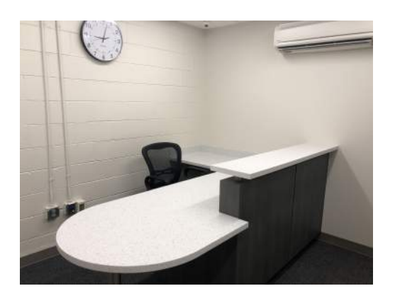
Installation of the Casework and Countertops in the Reception 104