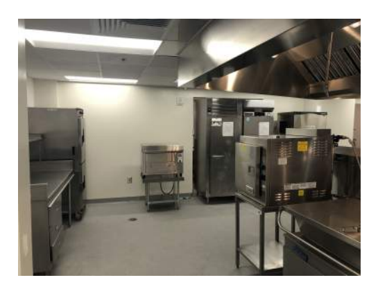
Installation of Kitchen Equipment in the Nutrition Kitchen 136